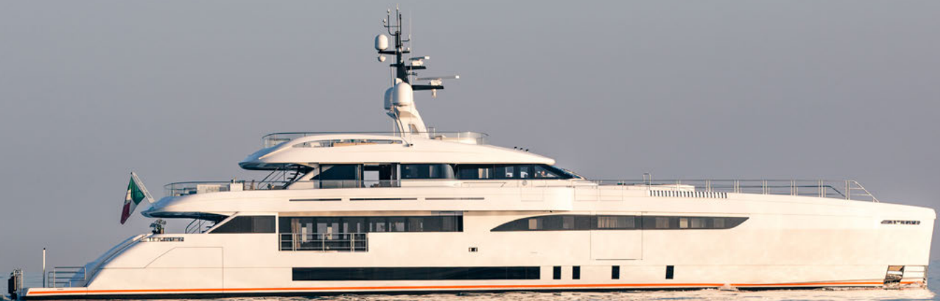
Diesel Electric Super Yacht | WIDER 165 M/Y Cecilia

The Ultra Fog droplet size is rated as class 1 according to the National Fire Protection Association (NFPA, USA), which ensures a very high extinguishing effect relative to the amount of used water. In fact, due to the minimal amount of water deployed, it is particularly suited for sensitive environments like electrical equipment. It has the added benefit of being environmentally safe and ensuring the safety of people and equipment.