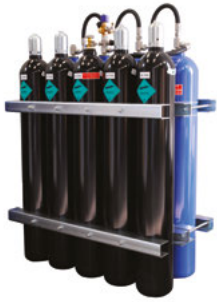
ULTRA FOG ACCUMULATORS