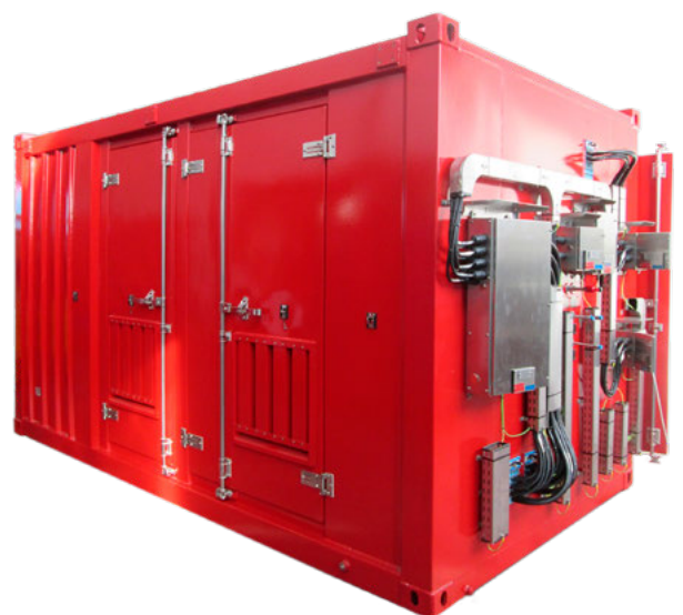
Ultra Fog container housing for accumulator units in hazardous areas