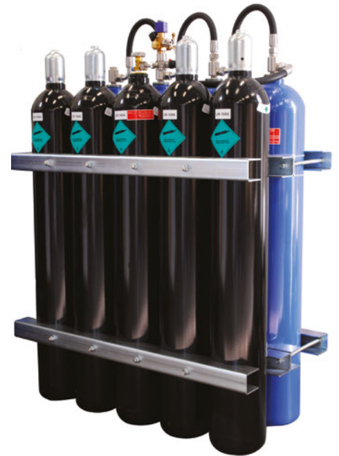
Ultra Fog Accumulators

Ultra Fog offshore and marine fire suppression systems are designed to save lives and property. Therefore it is extremely important that the systems work efficiently with a high degree of reliability. Our objective is to design, deliver and install systems of the highest possible quality, best possible functionality and provide service that exceeds expectations.