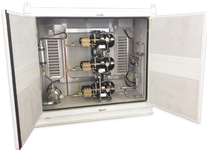
Micro pump unit and MPU 335 system with a dedicated enclosure